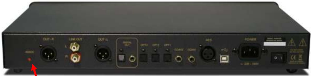
Association key (A)