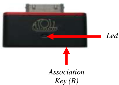
Association key + led (B)

When you purchase a new ATOLL « dongle », you have to associate it with the receiver board. Follow those instructions: keep pressing simultaneously association keys on the wireless board or DAC200 (A) and of the new “dongle” (B) (linked) till the indicator LED quickly blink. The “Dongle” and the receiver board are associated when blinking becomes slower (about 1 beat every 7 seconds).